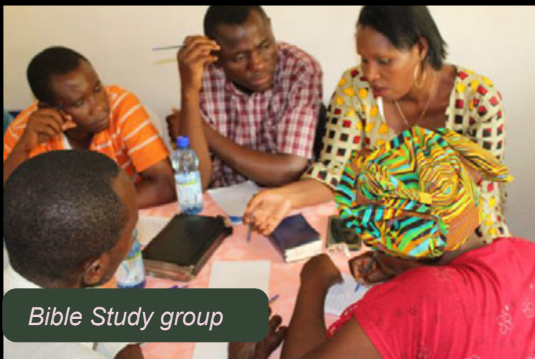
Bible Study group

Disciple making is the heart beat of our ministry we have remained focused on that. We wholeheartedly believe that The great commission is our responsibility. By partnering with like minded people 2017 is the year. we baptized 674 new followers of Christ and planted 109 house churches.