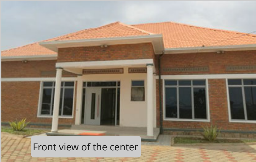
Front view of the center

The center which also hosts our head office will go along way in serving the ministry needs while also making it possible for our partners to serve our people inexpensively. Thank all that God used to support this project that is another milestone for our ministry.