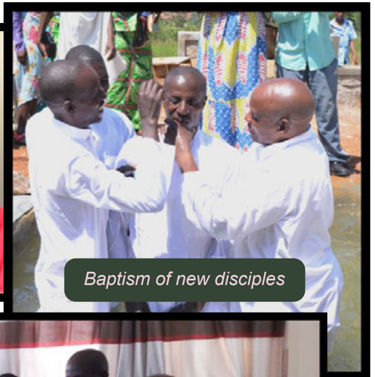
Baptism of new disciples