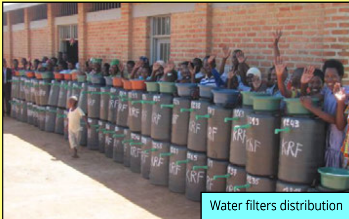
Water filters distribution

Many families in Sub-saharan Africa suffer the effects of dirty water. Through our partners and friends we have been distributing Bio-sand filters to help the families in Rwanda get access to safe and clean water which has also opened up opportunities to build relationships in the communities that has resulting in sustainable discipliship. This year we distributed 437 Filters n we are trusting God to do more in 2018.