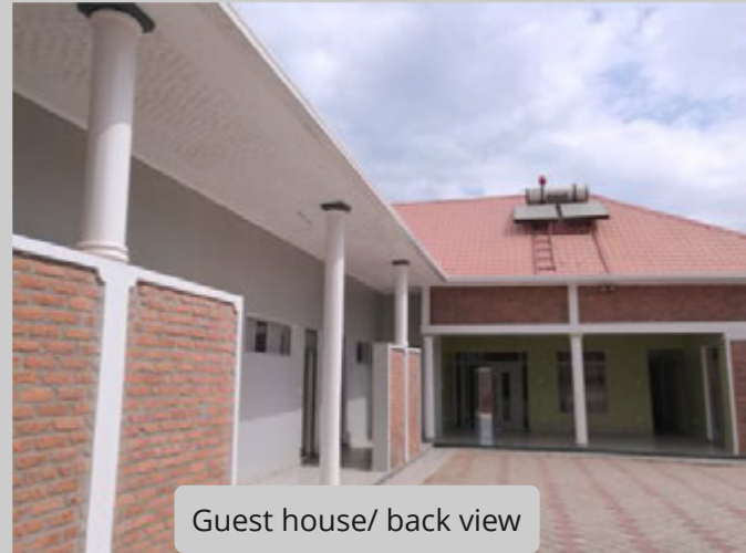
Guest house/ back view