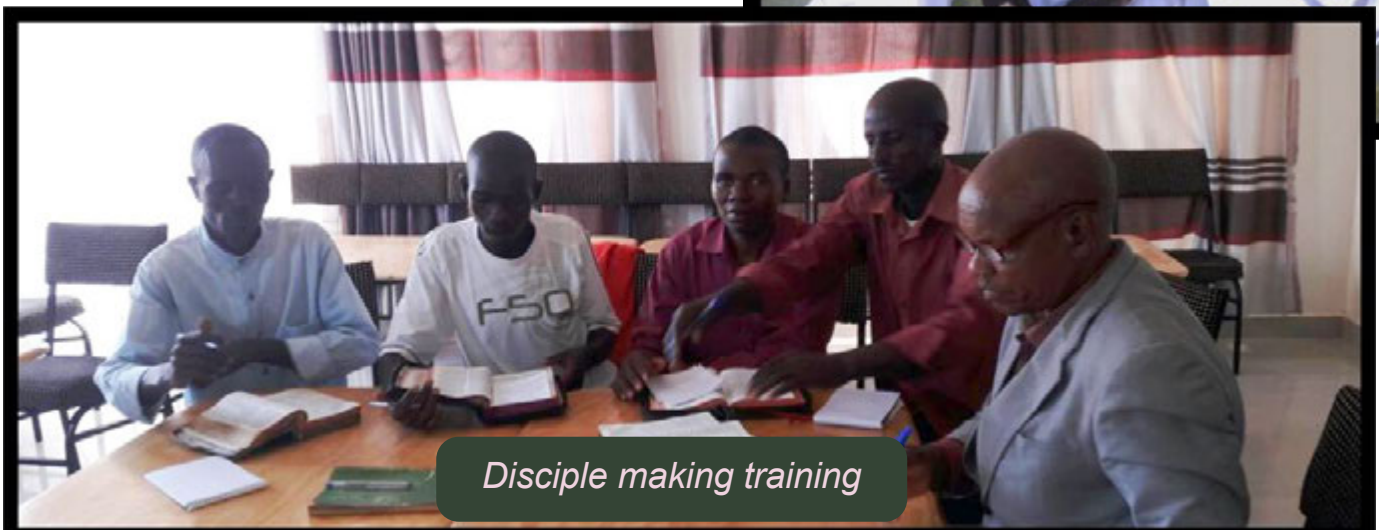
Disciple making training